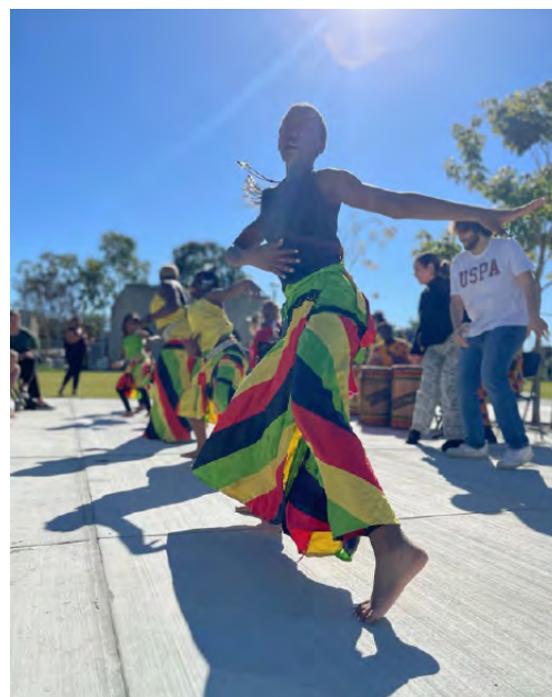
Members of African Soul International led the OCC community in song and dance on Feb. 6 in honor of Black History Month.

A complete list of OCC Black History Month activities can be found at https://orangecoastcollege.edu/services-support/gec/multicultural-center/index.html