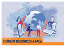
STUDENT RESOURCES & FAQs